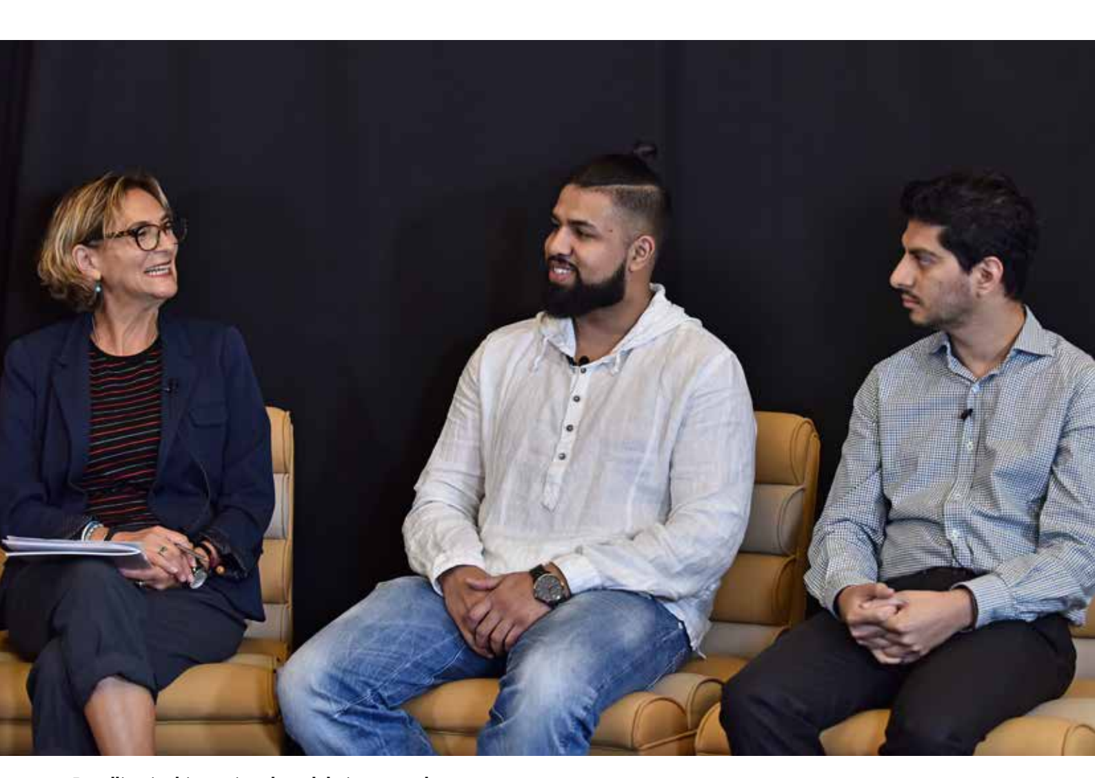
Panellists in this session shared their personal experiences with the global digital platform.