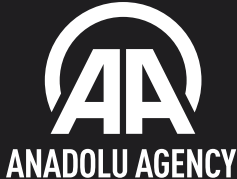
Global Communication Partner